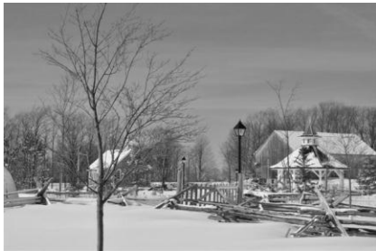
A sunny day outside at Grey Roots Museum & Archives

The Grey Roots Museum & Archives in Georgian Bluffs is home to the annual Black History Event and Journal Launch. Like last year, the event took place in February to honour Black History Month. With such a mild winter, a sudden blanket of snow was an unexpected turn of events. The Event organizers thought that perhaps the weather would be a problem for those travelling from out of town, but at the last minute, the snow stopped and the sun was shining.